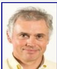
Dr JP Chanoine

Children with hypophosphatemic rickets are characterized by renal wasting of phosphorous and by their inability to 1-alpha hydroxylase the Vitamin D. The recommended dose of elemental phosphorous is 30-70 mg/kg/d divided in 4-6 doses. Tablets of phosphate can be difficult to find and may be expensive. However, products such as Fleet® (Lynchburg, Virginia, USA) contain large amounts of phosphate salts, can be taken orally, are widely available and are inexpensive.